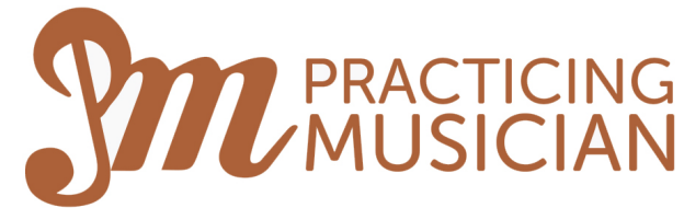
Logo with text